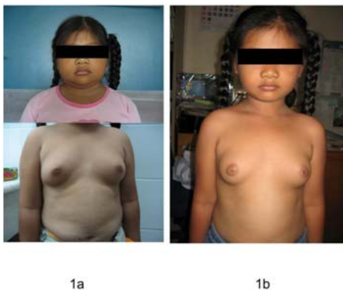
Figure 1. The appearance of the patient at diagnosis of Hashimoto's thyroiditis (a) and 3 months of thyroid hormone replacement (b).

metaphysis with an erosion of the greater trochanter (Fig. 3a). Pelvic ultrasound found a large ovarian cyst of 69 X 65 X 67 mm 3 in size at the Rt and 62 X 70 X 62 mm 3 in size at the Lt (Fig. 3b). The chest X-ray revealed a normal heart size and EKG found no mosque sign. The lateral view of the skull X-ray showed a widening of the sella turcica without erosion (Fig. 3c). A CT brain scan revealed a pituitary enlargement (Fig. 3d). Hashimoto's thyroiditis was diagnosed with secondary pituitary gland enlargement and ovarian cysts. Eltroxin was prescribed, starting with a low dose and titrated upwards while keeping up to the normal range. She had an onset and a regular cycle of menstruation at the age of 10 years and 10 months old. The Tanner degree of breast development was at stage IV and the bone age was 11 years by the Gleulich and Pyle method. At a recent visit, her height was 145 cm and the bone age was 15 years old. Her target height is 143 -158 cm.