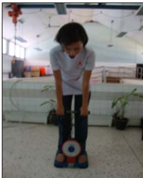
Figure 2. Back-leg dynamometer for measuring back muscle strength.

Subjects in the control group were given basic instruction on health education, activity of daily living, and there was an immediate follow up after the completion in the 6 th week.