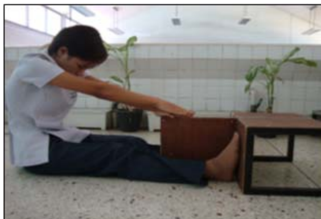
Figure 1. Trunk flexometer for indicating back and hamstring flexibility (sit and reach).

The study was designed as a double blind randomized controlled trial in which subjects randomly received 6 weeks of aquatic exercise or no aquatic exercise. Subjects in both groups did not have some medicine, physiotherapy, acupuncture and others treatment.