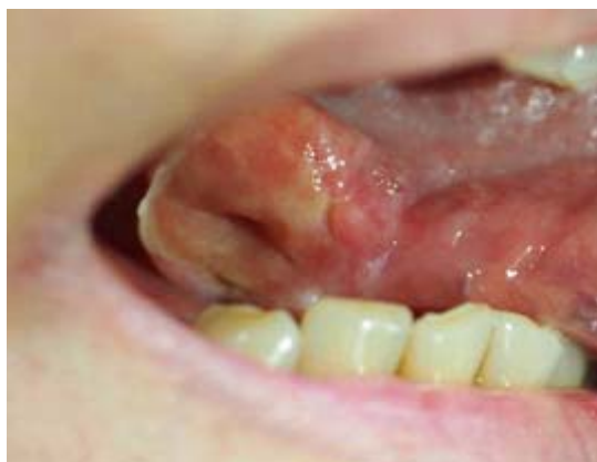
Figure 1. Clinical overview picture; A fungating ulcer on right lateral aspect of the tongue.

The patient received oral itraconazole 400 mg per day for 6 months until the lesion was completely cured.