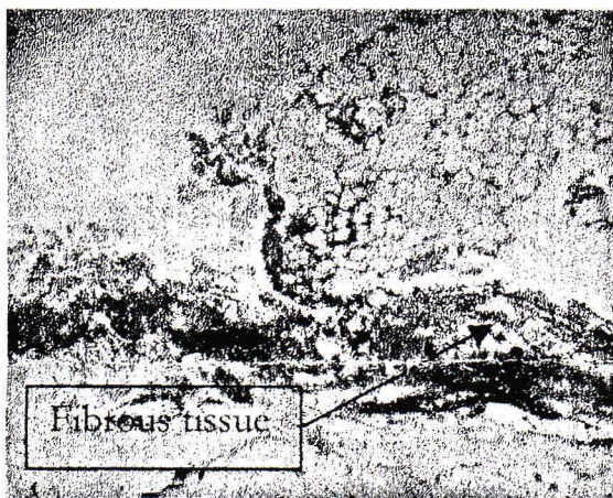
Figure 2. Histopathology of the tumor mass: fibrolipoma.

The tumor was ovoid shaped soft tissue mass with whitish, well-circumscribed outer surface capsule. There was neither villous proliferation on the surface