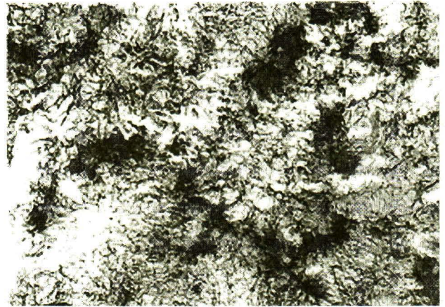
Figure 2. A higher power view of the transbronchial biopsy shows the characteristic 'sulfur granules' with darker amorphous colonies at the center and peripheral radiated arrangement of filamentous organisms, (GMS stain X 600).